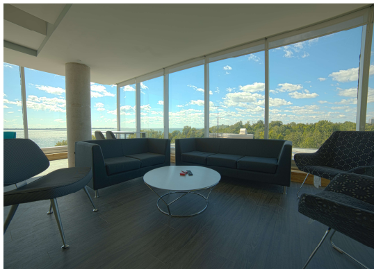
Common rooms on each floor